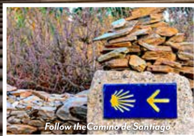
Follow the Camino de Santiago

The mystical story of Santiago de Compostela begins in the ninth century when a hermit named Pelagius reported seeing a field of stars that led him to an ancient tomb containing three bodies — that of Saint James the Great, one of Jesus' apostles, and two of his followers. It is believed that the body of Saint James (also known as Santiago, the patron saint of Spain) was carried to the coast after his death in 44 A.D. and put in a stone boat that was guided by angels to Padrón and then transported to the tomb that Pelagius would be miraculously called to more than 800 years later. Christian pilgrims soon began following the Camino de Santiago pathway to repent for their sins and visit the tomb at Santiago de Compostela. Today, this UNESCO-designated site is one of the most sacred pilgrimage destinations in the world. Your Santiago de Compostela excursion includes a tour of the old town and a visit to the hallowed sanctuary of the martyred saint. Marvel at the Romanesque and Baroque styles on its interior and see the silver urn that contains Saint James' ashes.