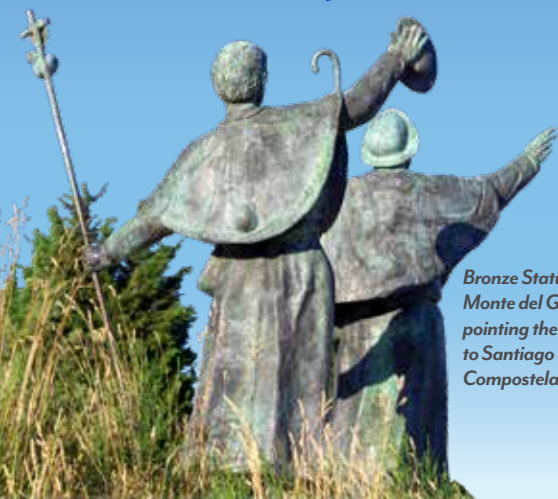
Bronze Statues at Monte del Gozo pointing the way to Santiago de Compostela (right)